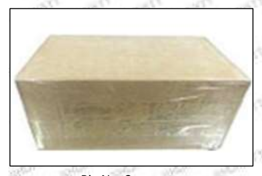
Pic No. 2 Domestic express packaging: Wrapped with Transparent tape

Minors are prohibited from using transparent tape, yellow tape, black wrapping protective film, and white wrapping protective film to avoid personal injury.